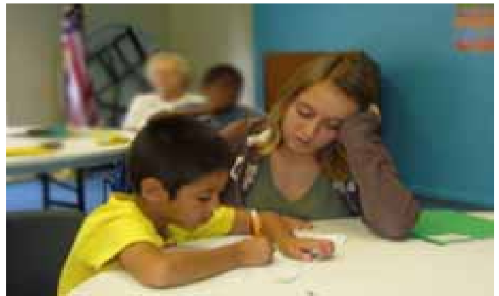
Local high school student tutors a young resident at NCSC throughout the year. A number of our members also support the annual Friend to Friend Event for Solutions!

St. Thomas More Parishioners have been providing hot dinners on a monthly basis to the Intake and Access shelter, which houses 30-40 people, for over five years. We collect a wide variety of necessary items for the children during our annual Christmas collection and