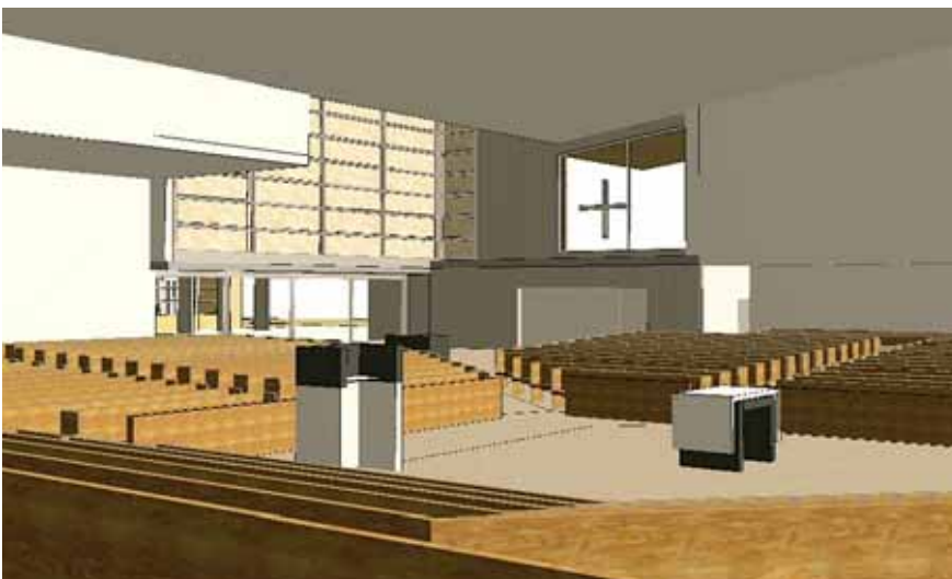
View of the interior of our new Church footprint

Click “Our Journey Into The Future. . . Together” and then the Capital Campaign Flyer dated 1/20/08.