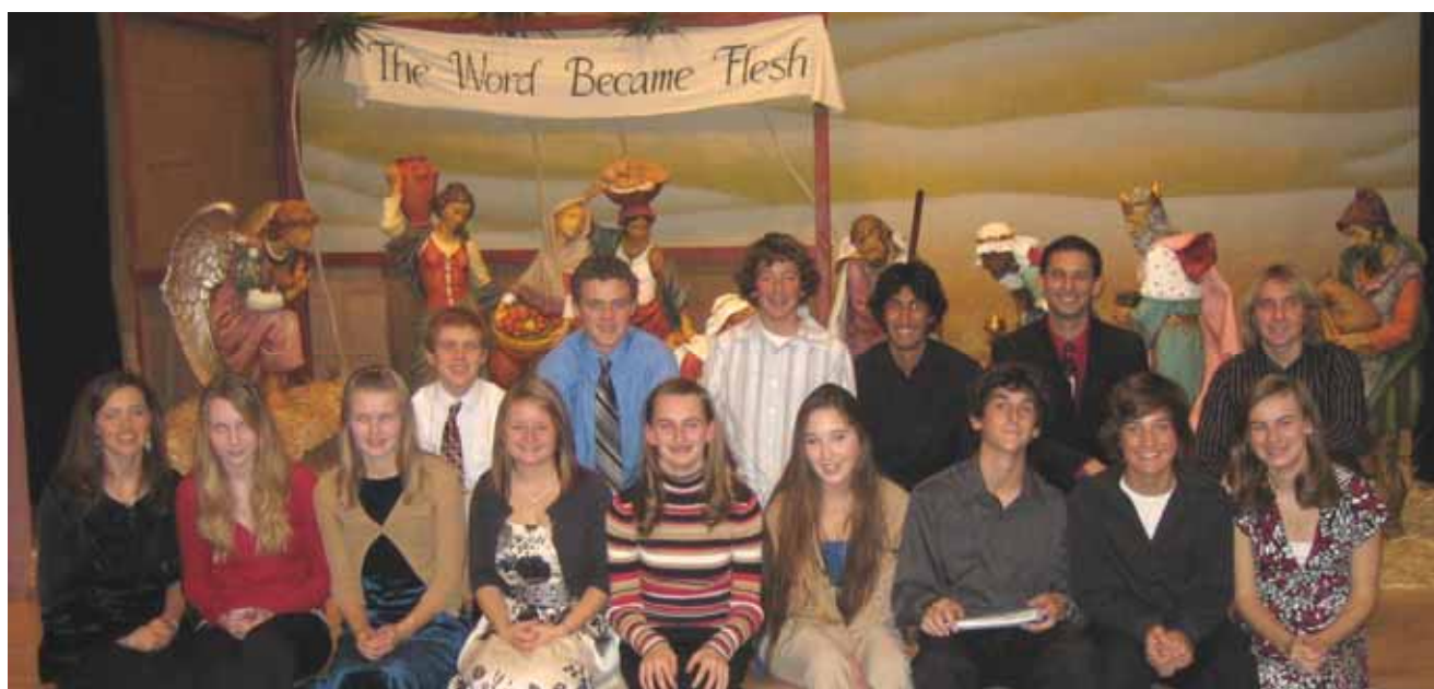
The Monday Night Mass Music Team members rejoiced by celebrating their first Christmas Eve Mass in 2007