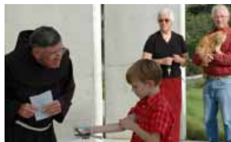
Blessing of Animals, February 2006

always enjoyed Southern California, his sister said. He wrote that he grew to enjoy the status of a military officer, especially after he was promoted to captain in 1981. “If I was spoiled before, this was frosting on the cake.”