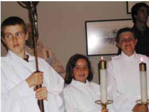
Altar servers prepare for Monday Night Mass

It is Monday night. You approach St. Thomas More Church from the parking lot. You draw near and hear a strange sound booming out of the church. Is it... drums? And bass guitar? You do a quick check to be sure you did not make a wrong turn on Cannon Road. No, you are definitely at St. Thomas More. You find out you have entered the...Monday Night Mass Zone!