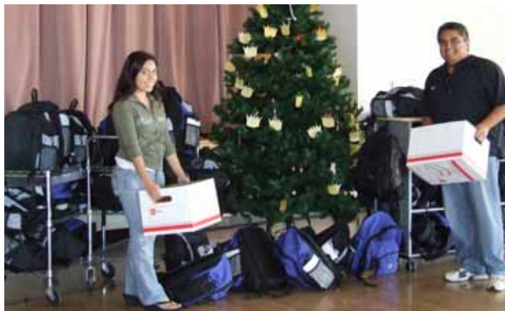
Christmas collection netted 44 fully stocked backpacks for Stand Up For Kids youth to help them through the winter months