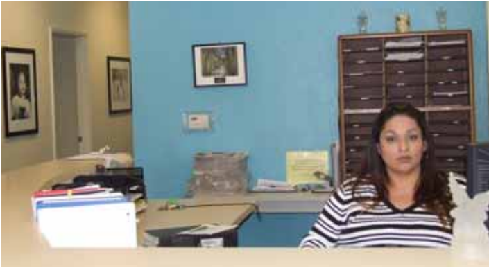
Reception desk at a Solutions location in Vista, California

Checking in at the front desk of North County Solutions for Change, I am greeted by a mother with her precious, porcelain-faced newborn girl who is settled in a bouncy seat. How wonderful it is, I think, that this place is so supportive of families and new mothers. It is not until later when I am on a tour of the apartments and have walked into the same woman's home