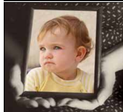
For more information or to volunteer, please call 760-941-6545 x304 or email at www.solutionsforchange.org