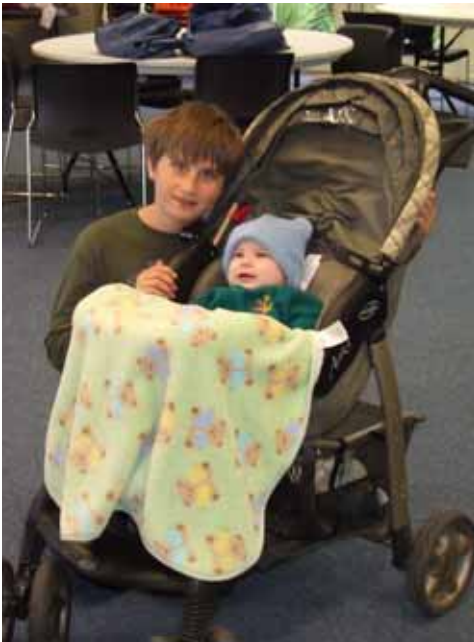
NCSC provides a warm and caring atmosphere on a cold, rainy day