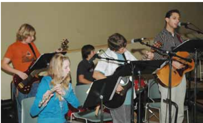
Our talented youth play in the Monday Night Mass Team!