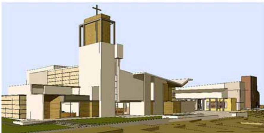
View of our new Church footprint from the parking lot—Parish Center is at far right