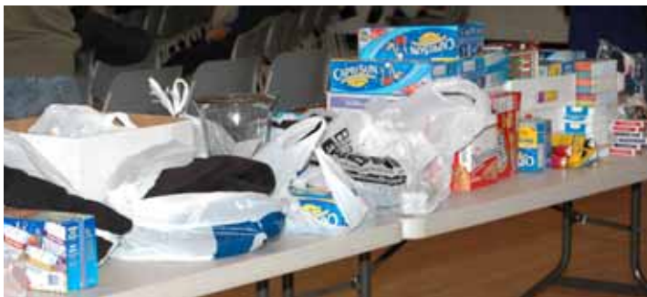
Monday Night Mass monthly collections for Stand Up For Kids help stock shelves for homeless teens in Oceanside