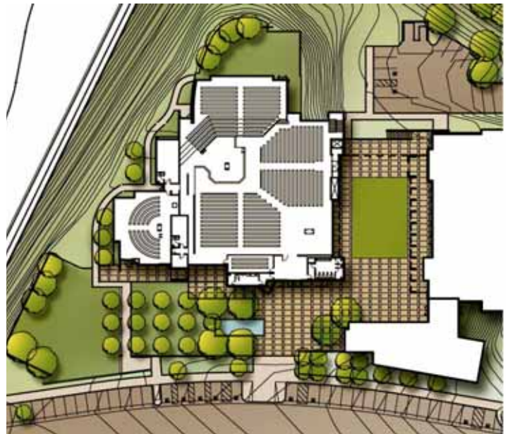
Preliminary footprint rendering of the interior of our new Church

As a Parish, you have been generous to the Capital Campaign. This generosity must continue as we move forward. It is estimated, at this time, that the Church will cost $8.5 million and the Parish Administrative Center will cost $1.5 million.