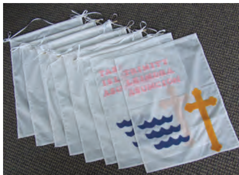
Baptism banners made with loving hands

One noble and unassuming woman has earned the title of ‘Secret Angel’ given her wish for anonymity and