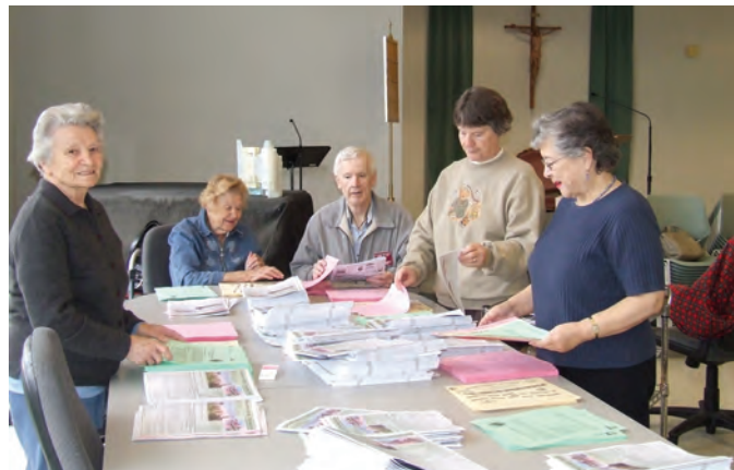
Always faithful servants, our Angels in the Wings tend to details that some take for granted.