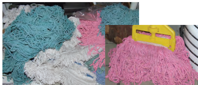
Oh, and about those mops...they are also cleaned weekly!