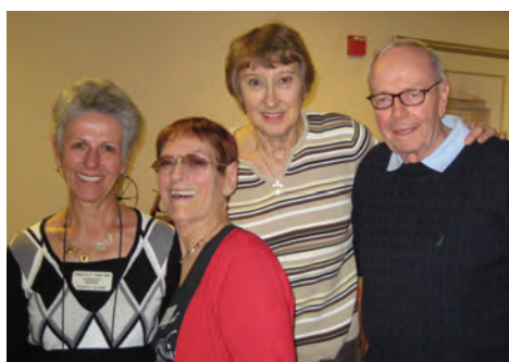
Ministers and residents share a special bond.