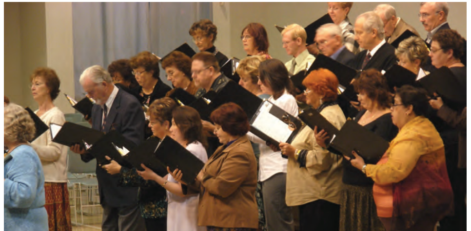
Members of our Adult Choir share their multiple talents at our "With Grateful Hearts" concert.

The transition from plans on paper to an edifice on solid ground will occur when we have both the funds on hand to qualify for a construction loan from the diocese and sufficient weekly contributions to sustain both the present structure and the new building. We pray that the Parish family will contribute generously to both so that we can replace those fluttering flags with a magnificent sanctuary. ♦