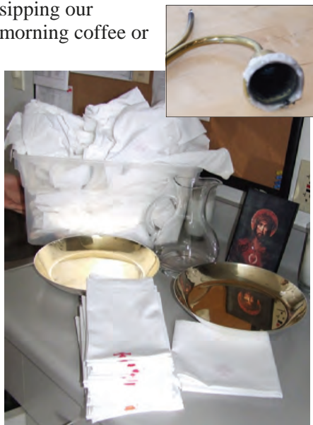
Candle drippings and lipstick are among stains cleaned weekly to ensure all is crisp and clean for weekly worship.

Who cleans up the candle drippings, scrubs out lipstick stains from the linens, dry cleans Fr. Mike's vestments, and stuffs the bulletins? We give these tasks little thought, but someone has to do them. When most of us are sipping our morning coffee or