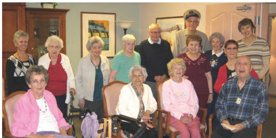
A vibrant spirit is shared by all at Pacific Place!