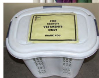
Vestments require care too...