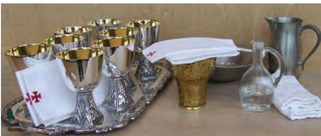
Prepared for weekday Masses and multiplied for weekends

returning home after Mass, a group of dedicated, humble individuals work tirelessly behind the scenes, doing the liturgical housekeeping. Like the nameless woman who went with Jesus and the disciples, providing for their needs without wanting acknowledgement, these people serve from the kindness of their hearts without expecting a thank you. There simply is not enough room to list everyone by name, and many wish to