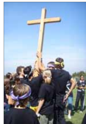
Youth Retreat 2007