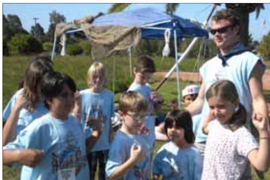
God shows His powerful love throughout Scripture...