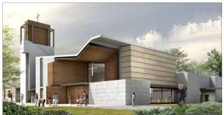
Rendering of Our New Permanent Church