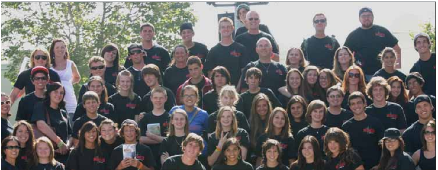
St. Thomas More High School Youth In Steubenville, July 2008

decided I was too old and thus they came up with my label. I told them the same thing I have told all the kids in the youth group for the past 13 years, that I am only 29 years old. ”