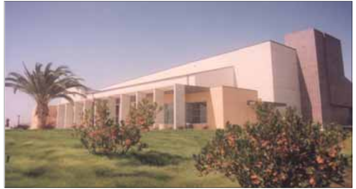
Parish Center Blessing, July 1, 2001

May this new strength and hope push us into the future and may the build-out of our Parish Campus with the construction of our permanent church soon be a reality!♦