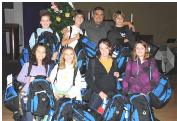
Backpack Collection for Stand Up For Kids, 2008