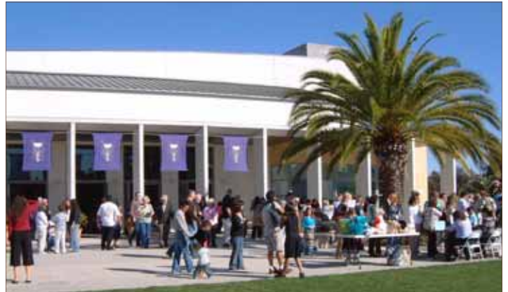
Faith and Fellowship Thrive on our Plaza after Mass, 2004