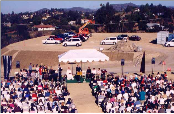
Parish Center Groundbreaking Ceremony, December 1999

short meeting with no specific agenda other than for Staff Members and Parishioners to get to know each other a bit better.