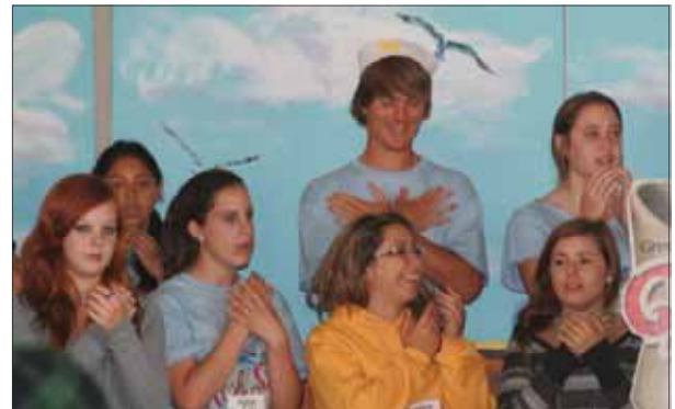
High school and college age teens provide leadership and care for crew members ranging in age from 3 to 11.

...a swashbuckling adventure through God's Word.