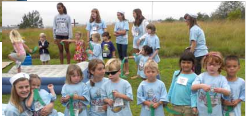
During games, the 3, 4 and 5 year olds re-enact how St. Paul survived the storm at sea.