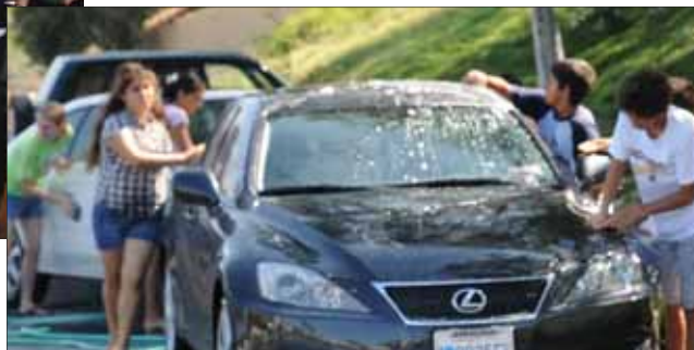
MS Youth Sunday Carwash — A Parishioner Favorite!