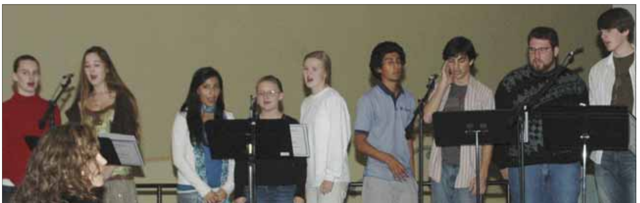
Monday Night Mass, 2009