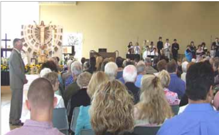
Celebrating the Easter Liturgy, 2007