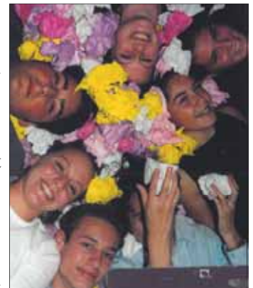
Priceless High School Youth Memories!