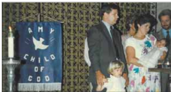
First Baptism at St. Thomas More, 1986