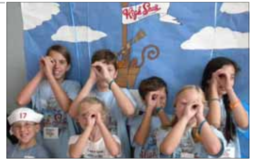
We call these "God Sightings."

Not only do kids experience amazing Bible adventures but they also watch for God in everyday life.