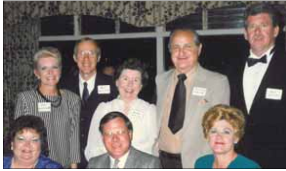
Some of our STM Pioneers, circa 1986