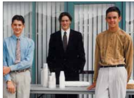
One of the first “Coffee and Donuts!”