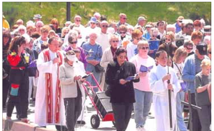
Stations of the Cross on Good Friday, 2005