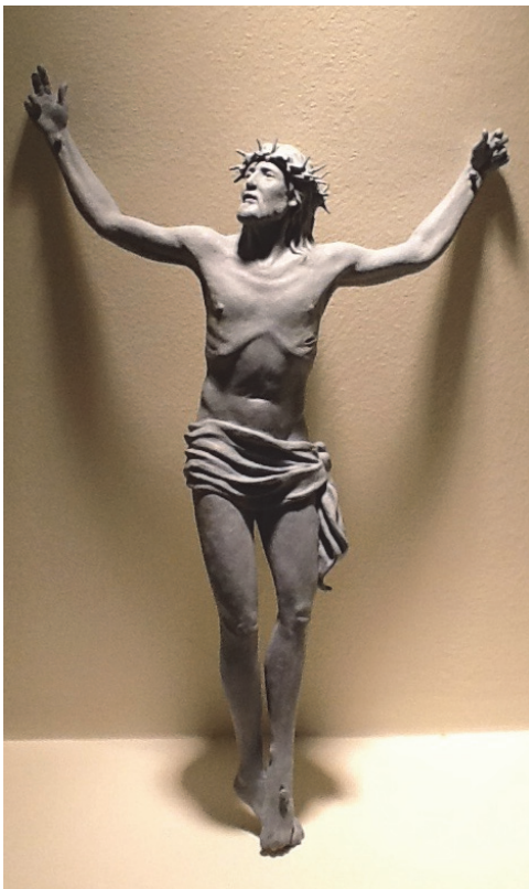
Our new Crucifix

Memorials are a way of honoring those whom we love, whether they are living or deceased. Often, memorials are made for a special intention or in thanksgiving for a variety of blessings received from God.