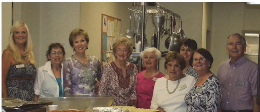
St. Thomas More Membership Committee