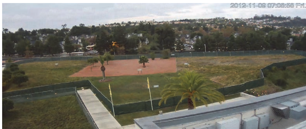
View from the top of the Parish Center over build-out area