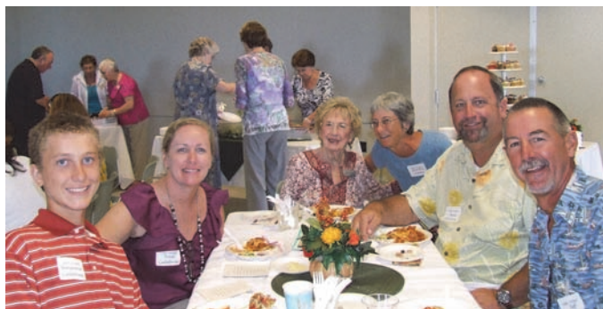
New Member Reception and Luncheon. September 30, 2012

High on my list was finding my new church. I needed that haven that church has always been for me. Now, if I’m honest, I admit, the day I walked into St. Thomas More, my first thought wasn’t exactly “Oh, thank goodness, I’m home!” No, it was more like, “Oh boy, not another build to support! Where are the kneelers? And, how can I pray when everyone is talking!”