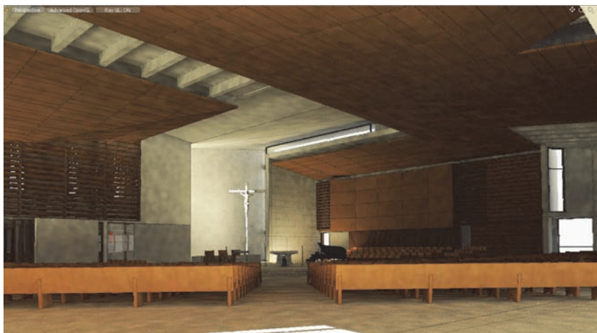
Interior rendering from the center aisle of the Church