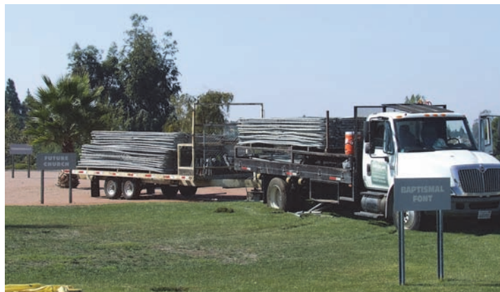
Installation of perimeter fencing. November 2012

Know that I am grateful for all that you have done, and all that you continue to do for St. Thomas More Parish. My nine years here as your Pastor have been the most precious years