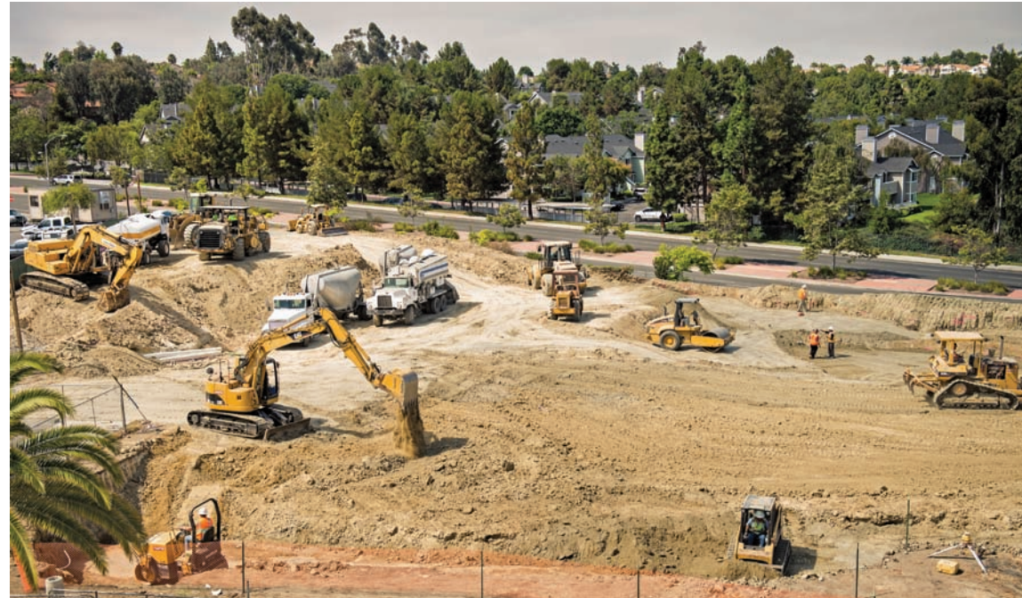
View of Construction site from our rooftop.