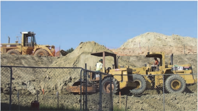
Area outside lower level back entrance/exit, not visible from webcam