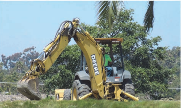
Temporary relocation of 20 ornamental strawberry trees