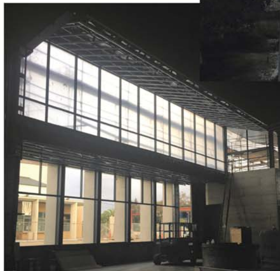
Side doors and windows of the church with the Baptismal Font (still packaged, bottom right), May 2015

Grace is defined as both an elegance and beauty of form as in charm or fluidity, as well as a manifestation of favor, especially by a superior. I feel we can see grace woven into every facet of our Permanent Church... into each carefully thought out work of art, and in the palpable presence of the Holy Spirit—our superior, guide, and friend.