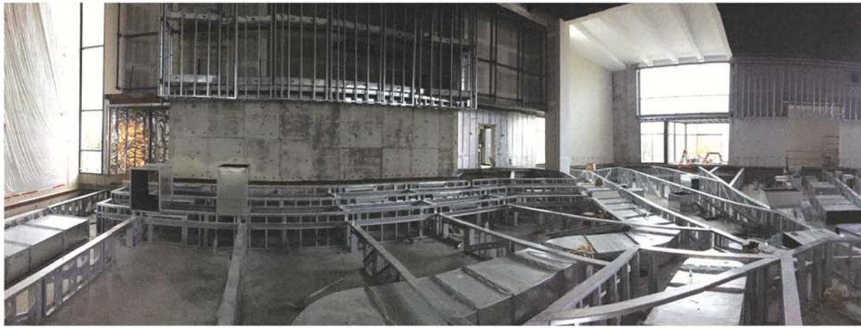
Panoramic interior view (north to east to south) from behind altar position, May 2015