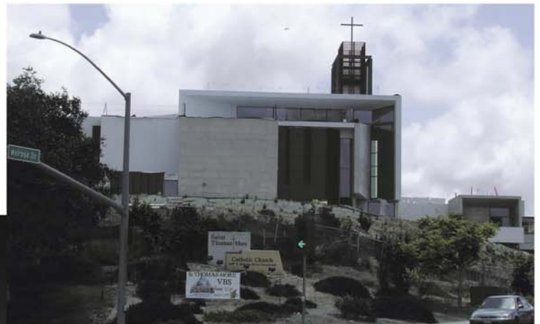
View from corner of Melrose and Cannon, May 2015

"This year we celebrate our 30th anniversary as a Parish. What a way to celebrate! We will move our formal worship of God from our Multipurpose Building, our Parish Center, to our new Permanent Church.