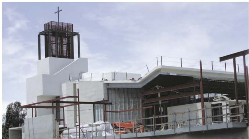
View of the front of our Church, with construction moving along quickly, May 2015