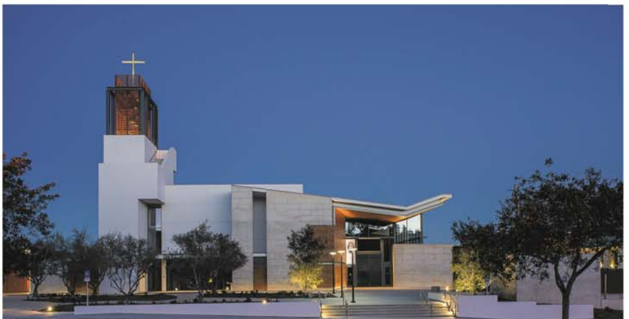
St. Thomas More Catholic Church — A Pilgrim Church for the Jubilee Year of Mercy