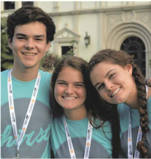
From left, clockwise, Parish teens at July Steubenville San Diego conference, Sanctuary Choir members visit the Christmas Angel table, Knights of Columbus and Faith Formation teams offer Christmas items and program information, and socializing on the Plaza after Mass.