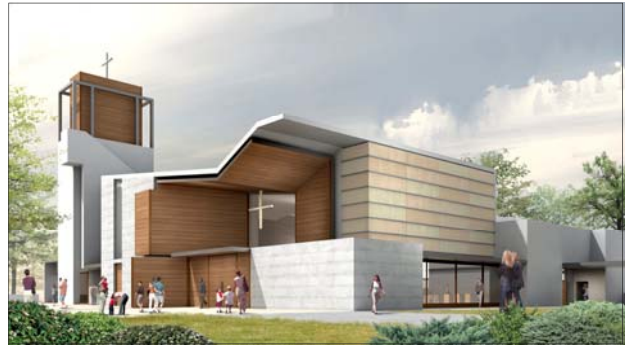
July 2011 ~ Plans are well underway Please continue to pray for our success!