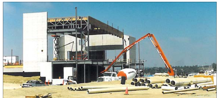
Summer 2000 Parish Center Work In Progress