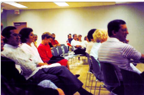
A Saturday night Mass at Calavera Hills Community Center

We are encouraged to reach out in our own way. I plan to leave my old cronies up front, and move back to sit with young people. I’ll tell them my name, and reward the one who remembers it with a chocolate donut! ♦