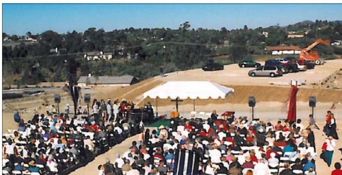
December 1999 Parish Center Groundbreaking Ceremony