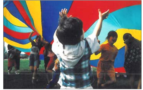
Timeless ~ Fun and Food at Picnics!