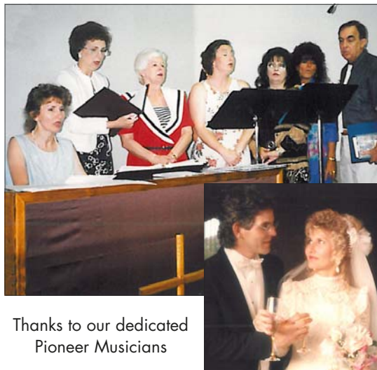
Thanks to our dedicated Pioneer Musicians