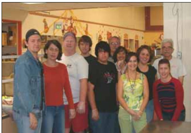
STM Volunteers experience the joy of helping out at Brother Benno's!

The Brother Benno Foundation provides a place for those in need to take a hot shower, eat a warm meal and change into clean clothes. It also provides transportation services to many of its "guests."