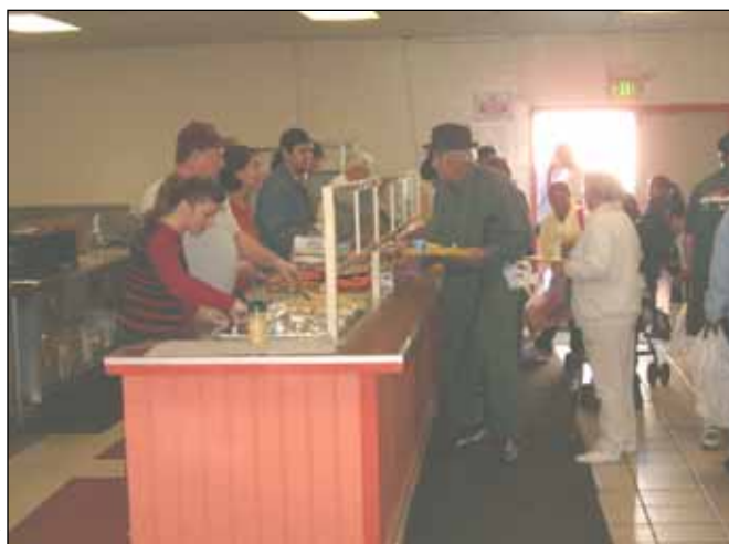
Brother Benno's guests being served a hot meal.

Donations to Brother Benno's can be mailed to 3260 Production Avenue, Oceanside, CA 92054.