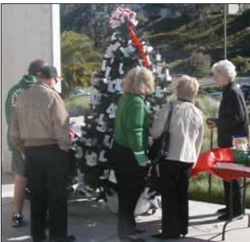
Parishioners are busy selecting ornaments!

Our beautiful tree is in the upper level courtyard after all Masses from November 20 through December 26, 2004. The tree is adorned each year with ornaments in the shape of stars, snowflakes, crowns and stockings. Each ornament has a specific type of gift request for specific ages and needs of children from birth to 17 yrs. old! Gifts are then purchased by parishioners and returned by the date specified on the specific tag. Birth Choice gifts, which are purchased specifically for infants, are traditionally returned on the weekend of the Epiphany (the first weekend in January, 2005.) We are most grateful for the incredible generosity of our Parish, as we help spread the true spirit of Christmas to as many children as possible!