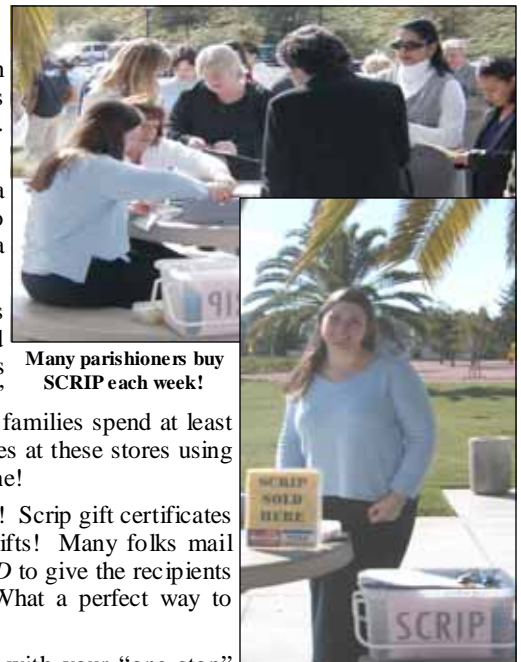
Many parishioners buy SCRIP each week!

The Scrip Committee consists of 11 dedicated volunteers, who are ready to help you with your “one stop” shopping after all Masses on weekends and Tuesday and Thursday , from 9-10 a.m., in the Parish Office. For more information, please call 760-758-4100, ext. 152, or check out our website at www.stmoside.org/development_council.htm (Scrip Sales).