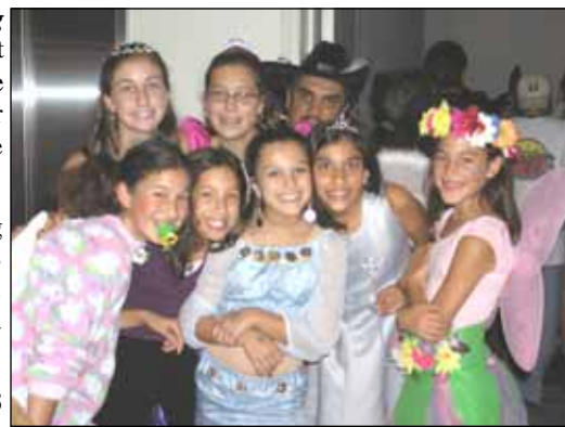
A good time was had by all at the Halloween Party!