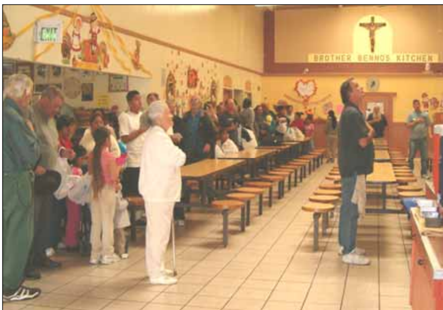
Prayer and reflection at Brother Benno's before a meal.