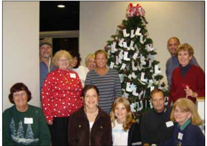
STM volunteers prepare the tree for 2004 season!

Thanks to the St. Thomas More family and its Christmas Angel Ministry, nearly 500 children in North County San Diego woke up on Christmas morning, 2003, to stockings brimming with goodies! Through our dedicated efforts, we were able to deliver more than 2,450 toys, gifts and gift certificates to help local families in need. That's enough to fill 10 minivans!!!