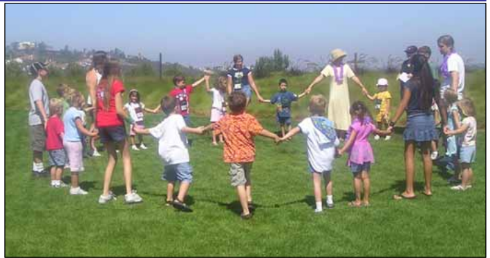
Outdoor fun during Lava Lava Island Summer Bible Camp.

Mahalo is Hawaiian for ‘Thank You’ and was the response the children gave if they heard one of the above verses. What a wonderful way to respond to the many gifts that Jesus has given us! Now, try to imagine the upper level of the Parish Center, completely transformed into a jungle with palm trees, monkeys, vines, coconuts a volcano and LOTS OF GREAT MUSIC!