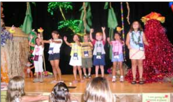
Music rings out at Lava Lava Island!

As a parent, one of the most precious things you can see in your life is the faces of your children singing the Praises of God. This camp’s exceptional music and the voices of the children and leaders rang through the church. Together with their leaders the children were ‘jumping up and down and spinning right around and praising His name forever’, they were ‘thankful and amazed that in His image we were made’, ‘every move they made they made in Him, every breath they took they took in Him’ and as ‘grace flowed down it covered them’. These are just samples of the beautiful and faith inspiring lyrics that the children learned during the week.