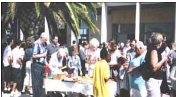
Parishioners gather on upper level courtyard after Mass

During the last year and a half, since I became the Pastor of St. Thomas More, I have come to feel very much at home here. This is a very warm and welcoming Parish where the members come together for spiritual growth, family enrichment and community outreach! This is all done with a real sense of joy and enthusiasm!