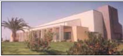
St. Thomas More Parish Center.

We are experiencing a season of growth at St. Thomas More! This year of transition has found our Development Council busy planning and coming to a consensus, with our Parish leadership and the Diocese, regarding the future plans for our campus build out at STM. Several joint council meetings were held during this decision making process. Informational Town Hall meetings were then held this past summer to share the updated plans for our Parish and to gather parishioner input regarding these decisions.