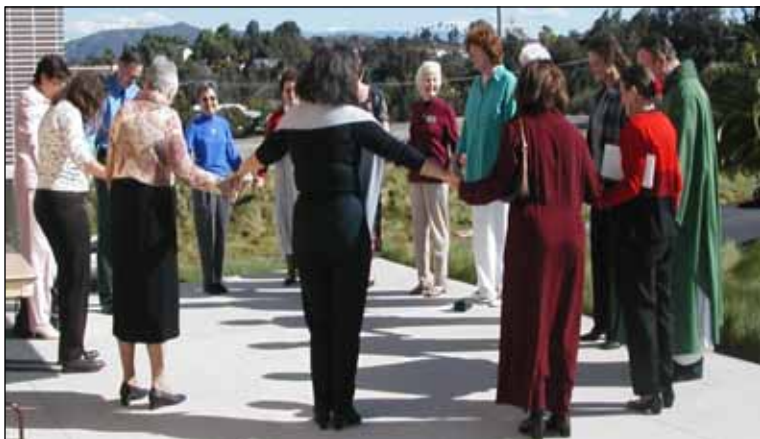
Ministers Prayer Circle before Mass.

God Bless you for all that you do. Remember that the Lord is never outdone in generosity!