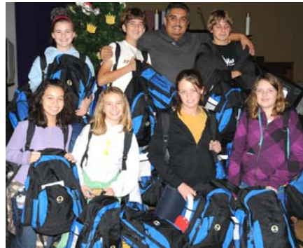
Middle School Youth supply backpacks and other items for Stand Up For Kids.

“You also, as living stones, are built up as a spiritual house, to be a holy priesthood, to offer up spiritual sacrifices, acceptable to God through Jesus Christ.”