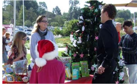
Christmas Angel Ministry collects thousands of gifts for multiple charitable needs.