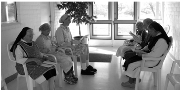
Praying the Office of Terce during morning work