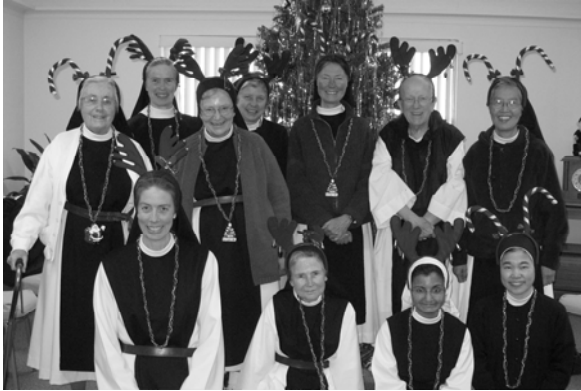
THE SISTERS OF SANTA RITA

There are many choices when it comes to finding the altar bread that becomes the Body of Christ for our Parish community. Although there are large corporate entities that make altar breads more cheaply, we have chosen to purchase our altar breads from the Sisters of Santa Rita, the Cistercian Nuns of Sonoita, Arizona, and this year, the Sisters of Santa Rita are celebrating their 30th anniversary of making altar breads.