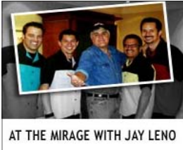
AT THE MIRAGE WITH JAY LENO