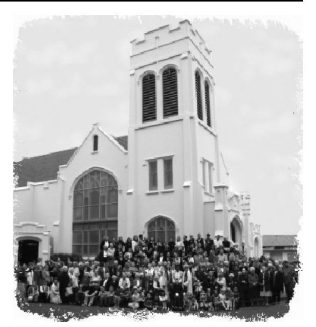
First United Methodist Church, Napa

for the Memorial Day weekend, stop by and see us! Even better, you can see and hear this great