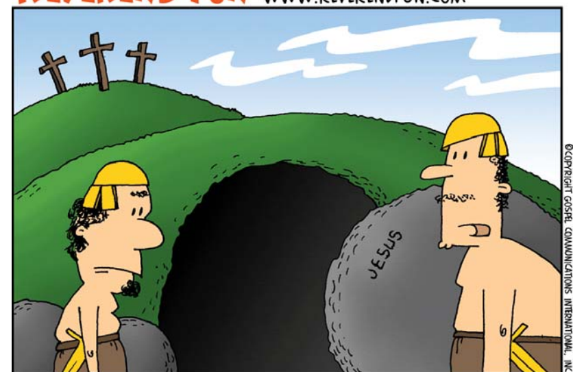
BETCHA TEN SHEKELS THOSE CHRISTIANS HAVE FIFTY NEW SONGS BY THIS WEEKEND

We sing those songs accompanied with piano...and organ...and guitars...and drums...and with nothing—the voice alone.