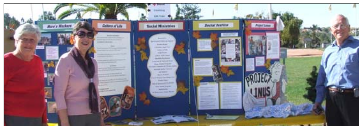
Social Ministries, Faith Formation, Liturgy, and Development led the Ministry Awareness weekend on November 14-15.