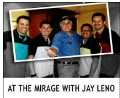
AT THE MIRAGE WITH JAY LENO