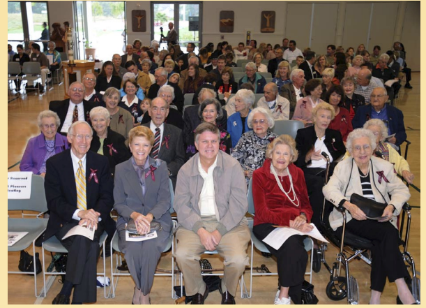
This space will be featuring different memories from our history each week.

A Roman Catholic Parish in the Diocese of San Diego