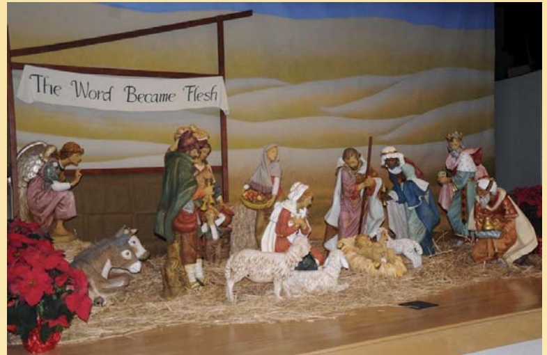
This space will be featuring different memories from our history each week.

The figures in our Nativity set were donated over the years by Parishioners.