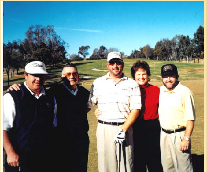
This space will be featuring different memories from our history each week. See page 4 for details.

The first STM Golf Classic was in 1999. Thanks to our dedicated volunteers, this annual event has raised over $450,000 for STM through the years. This year's Golf Classic is on Friday, June 3—put this on your calendar now and plan to be a part of the golf or miniature golf and evening festivities!