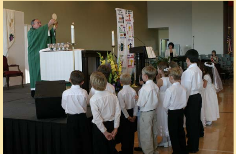
Every year during the Easter Season, a group of our young Parishioners celebrate their First Eucharist. This photo is from May 2008.

A Roman Catholic Parish in the Diocese of San Diego