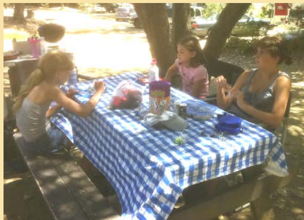
STM families enjoyed the annual campout last weekend—a bit warm, but good fellowship!

Click on the photo to see the whole album!