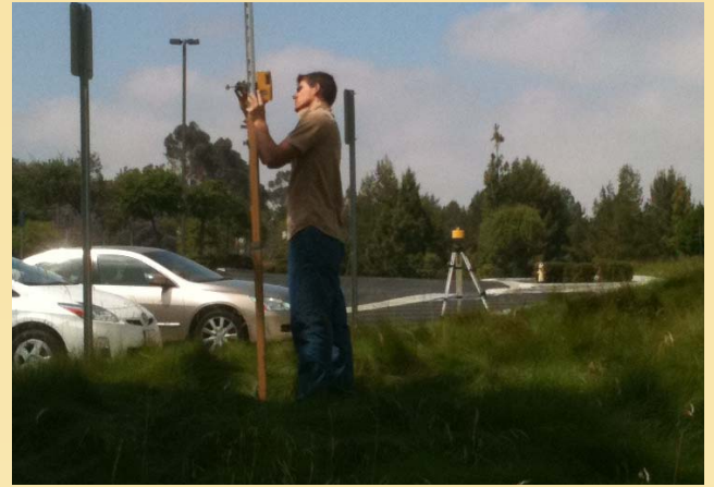
A member of the architect's staff taking measurements.