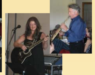
Music by Hot Pursuit

A Roman Catholic Parish in the Diocese of San Diego