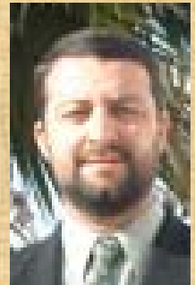
Imam Taha Hassane Islamic Center of San Diego