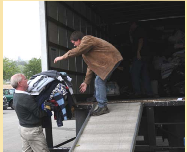
Help fill up the truck! The St. Bonaventure Clothing Drive is next weekend, November 12-13.