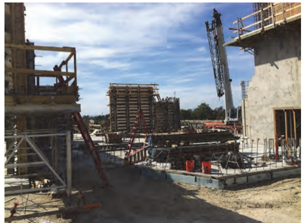
The daily chapel area

Check the Parish website ( www.stmoside.org ) to watch live action on our webcams (click on the camera links) or view the Construction Progress album.