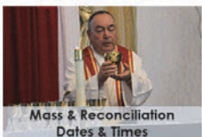
Mass & Reconciliation Dates & Times

Visit our website ( www.stmoside.org ) and click on Get Involved for an easy way to find the perfect ministry to fit your time and talent!