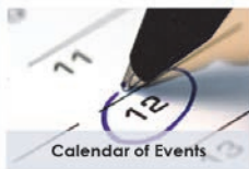
Calendar of Events