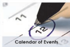
Calendar of Events