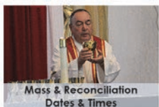
Mass & Reconciliation Dates & Times

Visit our website ( www.stmoside.org ) and click on Get Involved for an easy way to find the perfect ministry to fit your time and talent!