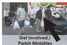
Get Involved / Parish Ministries