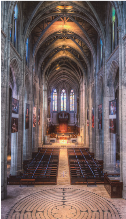
San Francisco's Grace Cathedral

The Sanctuary Choir has been invited to sing at San Francisco's Grace Cathedral next June as part of a three-day residency for 120 singers who will be preparing and presenting Gabriel Fauré's Requiem in concert with orchestra and soloists at the cathedral on Monday evening, June 6, 2016.